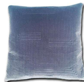
OPTIONAL : LINEE FENDI CON LOGO FF / FENDI LINES WITH FF LOGO 50x50 cm 19 3/4x19 3/4 "