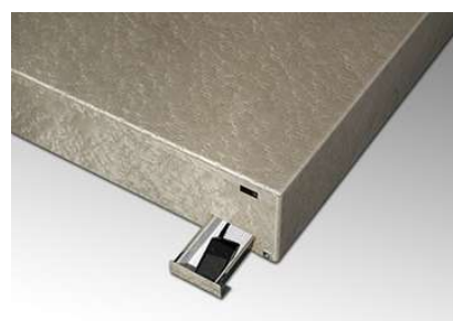
TCT (CA17L) - TCT (CA17R) - TCT (CA17E) - TCT (CA17P) QUADRUM : COFFEE TABLE 90x90x24H. cm 35 1/3x35 1/3x9 2/4H. "